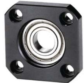
Black Oxide (Fit for normal conditions)