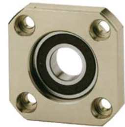
Nickel Plating (fit for dust-free conditions)