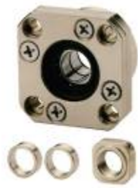
Nickel Plating (fit for dust-free conditions)