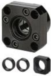
Black Oxide (Fit for normal conditions)